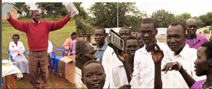
See a video about this project at: www.woh.org/voice/videos