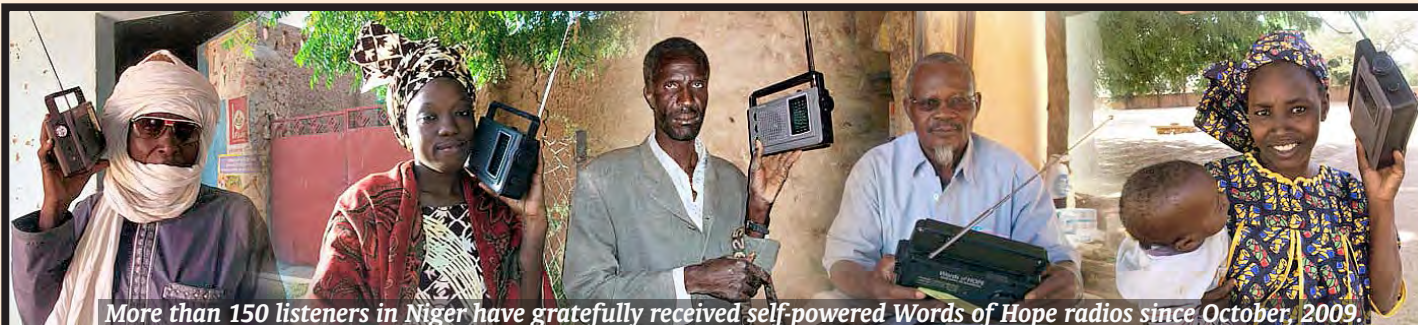
More than 150 listeners in Niger have gratefully received self-powered Words of Hope radios since October, 2009