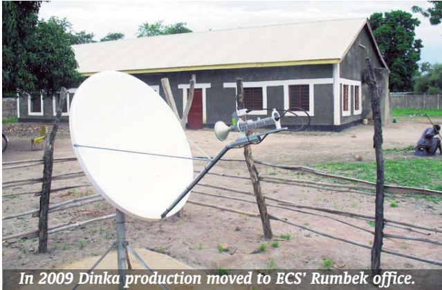
In 2009 Dinka production moved to ECS' Rumbek office.

Good News. No Boundaries. 700 Ball Avenue NE • Grand Rapids, MI 49503 • 800-459-6181 • www.woh.org January-February 2010