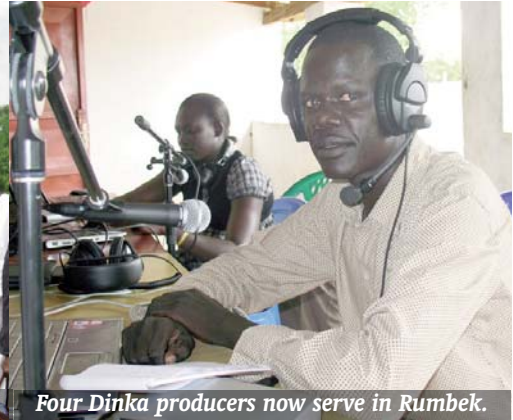
Four Dinka producers now serve in Rumbek.