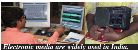
Electronic media are widely used in India.

The pooling of resources and expertise through these partnerships is facilitating ministry expansion and operational effectiveness.