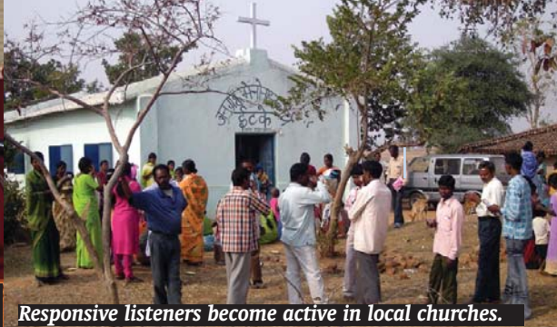
Responsive listeners become active in local churches.