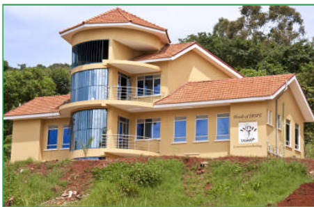
Words of Hope Communication House

The Christmas gospel is ever new, and always thrilling. It is our unspeakable privilege at Words of Hope to publish and proclaim this message throughout the world to those who need it most.