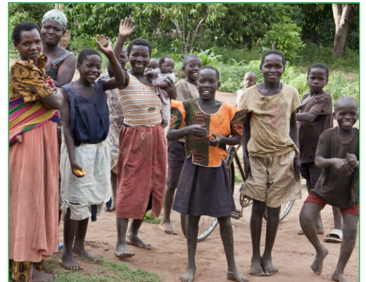
School children in Namusala, Uganda

Uganda is a land of contrasts. It is known as “The Pearl of Africa” – a land of lush, green beauty and fertile fields. It’s also a place of poverty and want, with displaced person camps and shanty-town slums filled with refugees from Congo and Sudan. Ugandan Christians practice their faith with wonderful joy and exuberance. The church is alive and growing in Uganda; but so is Islam. And there is great spiritual darkness in the land. While I was there I read a story in the newspaper about two men who had been arrested for trying to sell their own children to witch doctors for use as human sacrifices. Somehow, the power of the demonic seems closer to the surface in Uganda.